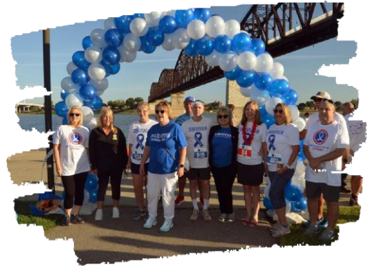
Our amazing survivors!

This year's Scramble was the best yet. We had a beautiful day on the course and raised money for an amazing cause. Special thanks to Audubon Country Club for hosting this event and making it so special!