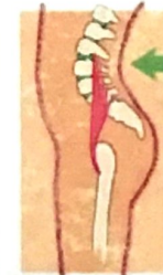
Lumbar region bowed by shortened psoas

Spines that don't move become inflexible and susceptible to damage in mundane activities, such as when you reach for a coffee cup or bend to tie a shoe. When we move around, soft disks between vertebrae expand and contract like sponges, soaking up fresh blood and nutrients. When we sit for a long time, disks are squashed unevenly and lose sponginess. Collagen hardens around supporting tendons and ligaments.