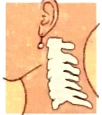
Proper alignment of cervical vertebrae

If most of your sitting occurs at a desk at work, craning your neck forward toward a keyboard or tilting your head to cradle a phone while typing can strain the cervical vertebrae and lead to permanent imbalances.